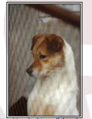
Xiao Hua looking all handsome